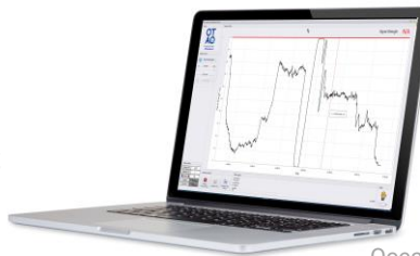
Oceansense Windows App