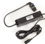
USB communications lead