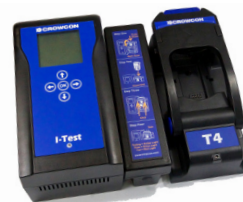
I-Test Easy automated bump testing and calibration solution